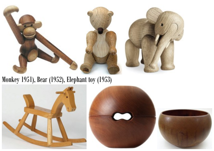
Rocking chair (1936), Teak salad bowl (1949)

metalware, receiving a Grand Prix at the IX Milan Triennale (1951). He was appointed silversmith to the King of Denmark with international acclaim including a gold medal at the Milan Triennale (1954) for wooden designs of characteristic monkey and puffin toys, and functional yet sculptural teak salad bowls.