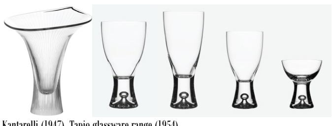
Kantarelli (1947), Tapio glassware range (1954)

Wirkkala pioneered an expressive language of organic form that was a modern but timeless beauty. He won many awards - the Lunning Prize (1951), the Golden Obelisk, Domus Italia (1963), the Prince Eugen Medal (1980). Besides Ultima Thule range (1968), he designed jewellery, the package of Finlandia vodka bottle, etc. "No one has ever invented new forms, It's only a question of how line and shape are used." His form-giving skills created objects of extraordinary originality, imbued with intelligence, simplicity, tactility and beauty, underlying humanist ethos.