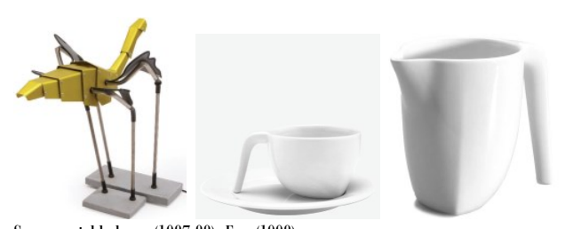
Scaragoo table lamp (1987-88), Ego (1998)