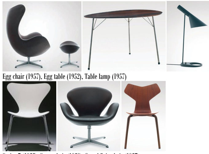
Series 7 (1955), Swan chair (1958), Grand Prix chair (1957)

and the Rothenborg House in Ordrup (1930). Jacbosen and Erik Möller won the design competition (1936) of the Århus Town Hall, whose scheme was distinct by soft lines that revealed a humanistic Modernism with organic forms. He designed mass production furnitures such as Ant chairs (1952) and Series 7 chairs (1955). The latter was the most successful seating programme: a standard single-form compound-moulded plywood seat with a wide range of attachment. For the SAS Air Terminal and Royal Hotel in Copenhagen (1960), Jacobsen made every detail from cutlery to furniture. Egg and Swan chairs (1958) were futuristic and aesthetic. For him, buildings and products should have a proportion: materials and colours compatible with achieving overall impression. He combined sculptural, organic forms with traditional Scandinavian design attributes of material and structural integrity to produce timeless, elegant, and functional designs. "Pastry usually tastes best when it looks nice... there's nothing I mind if it looks nice."