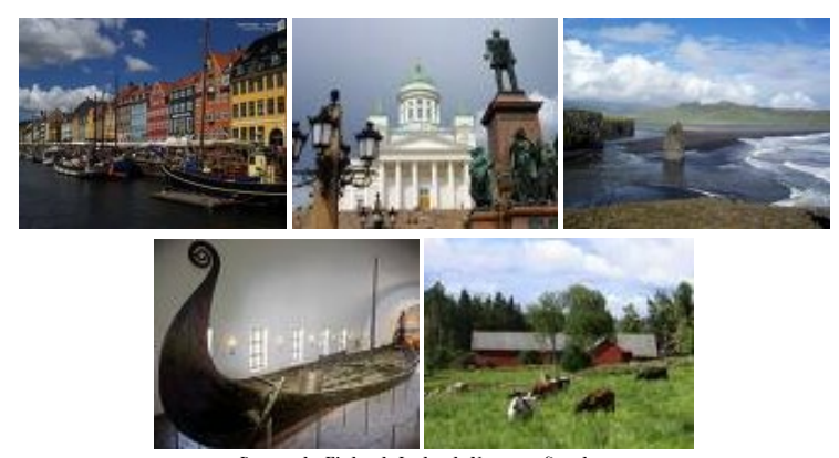
Denmark, Finland, Iceland, Norway, Sweden

The five countries have not always kept a good relationship, but today's peaceful competition over design proceeds by sharp confrontation. Danish designers establish a tradition of quality, while Finnish star artists bring small objects to the realm of art. Icelandic designers are gaining a status for their cultural contributions, and Norwegians are securing an established position, being supported by the state. As a large group, Swedish designers succeed to satisfy the needs of society through design.